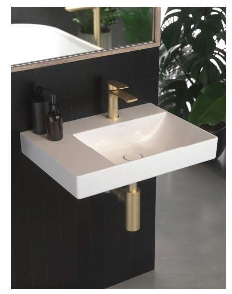
Tapware is shown for photographic purposes only