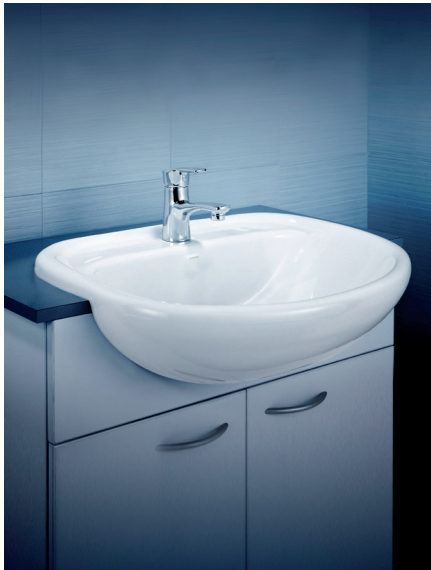
Tapware shown for photographic purposes only.

A modern concept semi recessed vanity basin incorporating functional bowl surrounds with smooth rounded contours for easy cleaning and available in two sizes. The Caravelle 600 and Caravelle 550 are generously sized basins with two soap holders and have been designed to co-ordinate with other products in the Caravelle range. This basin is suitable for domestic, commercial and accessible applications (refer to Compliant Product section).