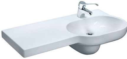
Left hand shelf pictured.