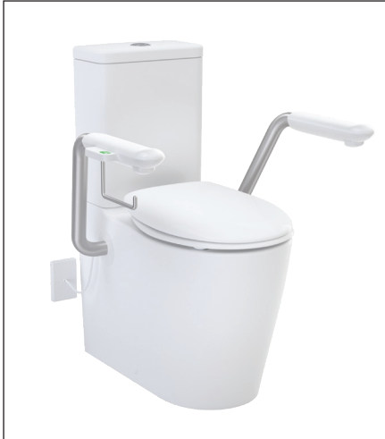
Right hand Nurse Call Button version shown above.

Note: This suite is not suitable for AS1428.1 installations.