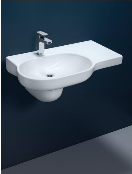
Right hand shelf pictured

Tapware and shroud shown for photographic purposes only