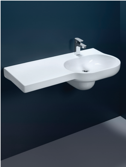
Left hand shelf pictured.

Tapware and shroud shown for photographic purposes only.