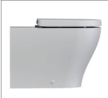
Pictured with Caroma Xena soft close seat

Caroma Coolibah is a range of contemporary essentials designed to suite your lifestyle. Combining an enduring design with rimless pan technology, the Luna Cleanflush™ is a superior flushing system suitable for domestic and commercial applications. Incorporating several patented technologies: Caroma Flow Splitter™, Caroma Flow Balancer™ and Caroma Uni-Orbital® Connector, the Cleanflush pan is innovative and the next evolution in toilets. The Flow Splitter evenly flows water around the top of the bowl to meet at the Flow Balancer which directs the water powerfully into the sump, reducing the need for brush cleaning. The rimless pan is easy to clean and unlike traditional pan profiles, provides full visibility of any grime build up. Caroma Cleanflush provides a cleaner clean for peace of mind.