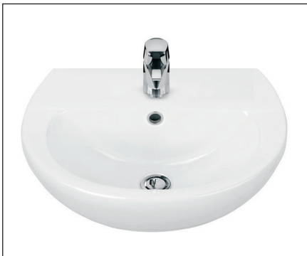
All taps pictured are shown for photographic purposes only