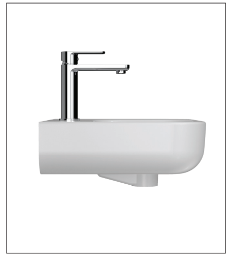
Tapware shown not included.