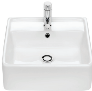
Mixer is shown for photographic purposes only